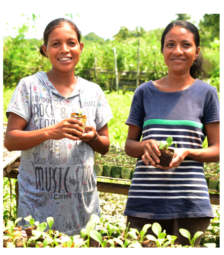
Justice. Compassion. Love.