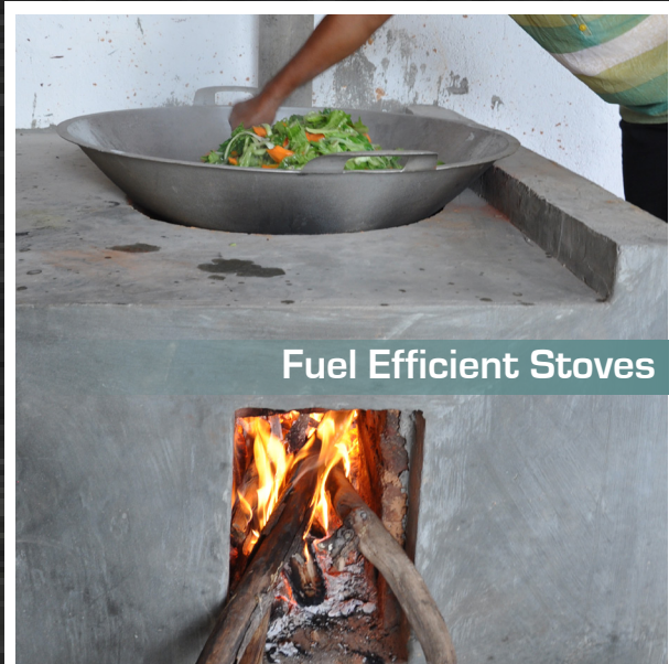
Fuel Efficient Stoves